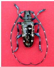
Male Asian Long-horned beetle