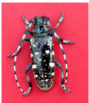
Female Asian Long-horned beetle