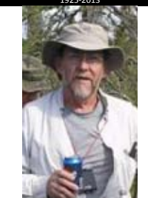
36. Robert McNamara