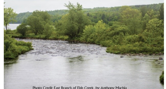
East Branch of Fish Creek

Please call 315-785-2380 with any questions.