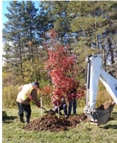
Tree planting at Floyd's town park.

While Boonville was able to complete their salt storage just in time for winter, the town of Floyd continued efforts to complete improvements at the town park including tree planting through round 13 of DEC's Urban and Community tree planting program. Along with the town's match, about $30,000 in grant funding allowed for the purchase of 128 trees and associated supplies for its town park. The town is building a walking trail at the park in a relatively open field and it wished to plant 118 shade trees along the path to increase user safety, improve and enhance wildlife habitat and improve soil and air quality. Ten trees will be planted at areas in the already developed parts of the park.