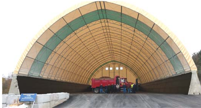
Boonville's dump truck inside the new salt storage facility.

NOCCOG and Tug Hill Commission staff aided in the grant submission for a 160 foot by 72 foot salt storage facility, to provide protection for the nearby municipal water supply and Black River Canal. The town was able to utilize in-kind services of the highway department for much of the site prep, while being eligible for about $360,000 in grant dollars for the structure and related work. The massive building, located on Route 12, will also be used by the Village of Boonville.