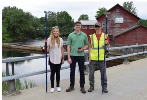
2017 Tug Hill area interns, in partnership with the Pratt-Northam Foundation and Syracuse University Environmental Finance Center.

Interns can also be an important resource, as they may be able to help with data collection or even implementing a GIS. There are many organizations that can help provide funding for interns. Two of these organizations are the Pratt-Northam Foundation and the Environmental Finance Center at Syracuse University. In addition, some colleges may require their students to intern in their field of study, which may be paid for by the college. Check with local colleges or high schools about internship programs they can offer.