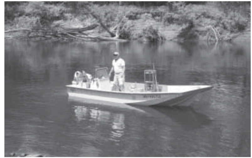
Army Corps staff install navigation aids on the Black River.