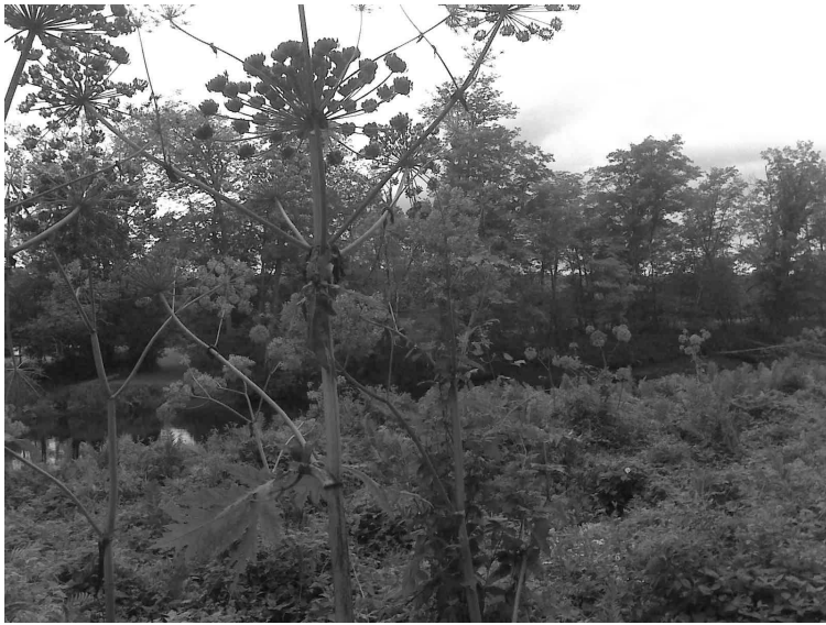
Giant Hogweed along the Black River in Lewis County.

Giant hogweed is an herbaceous, biennial plant that in-