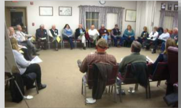
Representatives from all five Tug Hill Councils of Governments discuss common issues at SuperCOG.