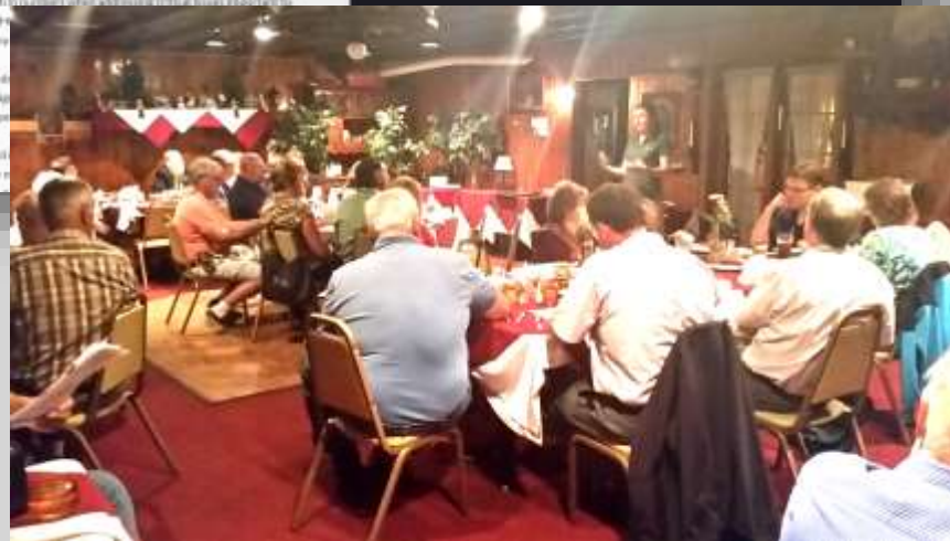
Fall dinner attendees hear about proposed wind farms.