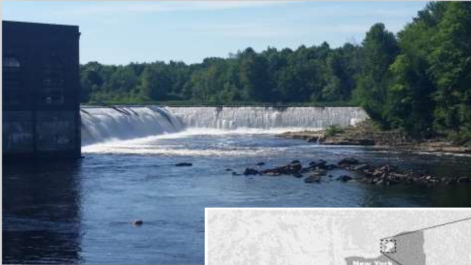
View of Black River from remediated Crown Cleaners Site in Wilna.