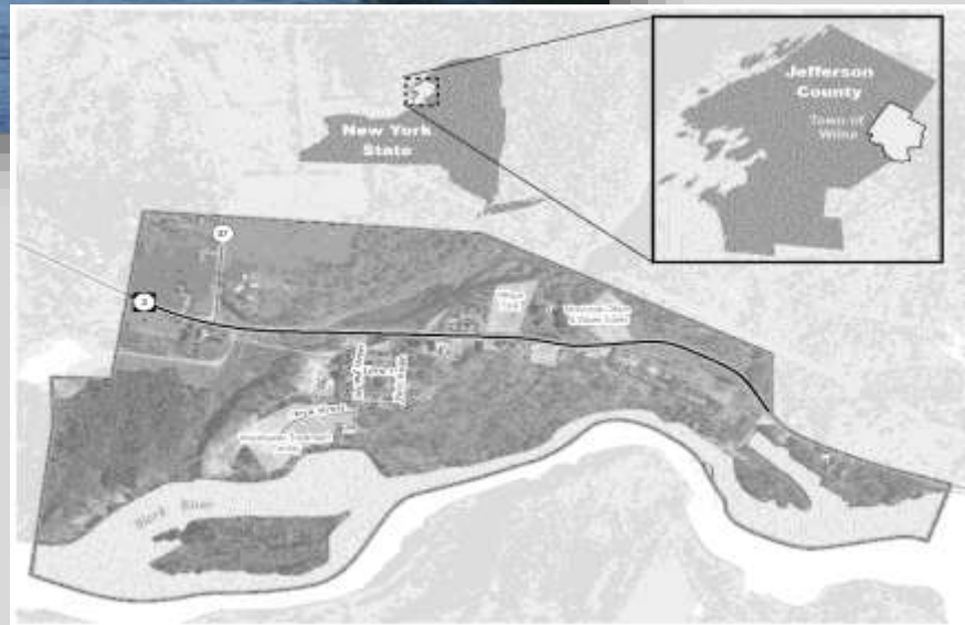
Map of Herrings prepared by staff to support dissolution plan.