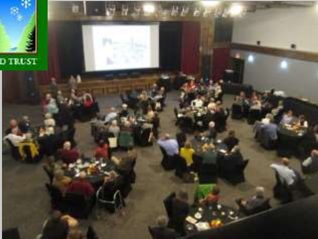
Tug Hill Tomorrow Land Trust holds 25 th anniversary dinner at the Kallet Theater in Pulaski.