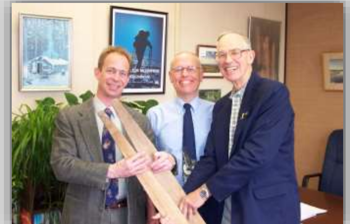
The last time the skis were passed was in 2004.