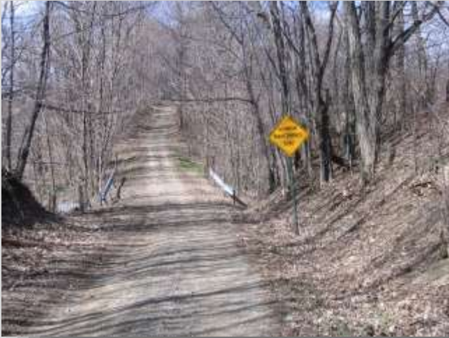
Weikel Decision in Lewis County Supreme Courts puts designation of minimum maintenance roads in jeopardy.