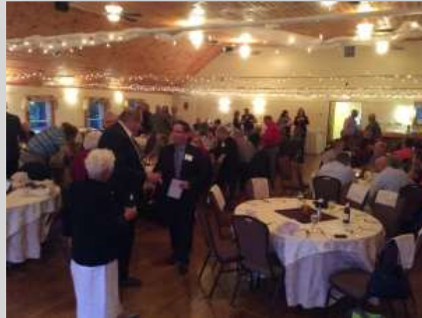
Above: Attendees at NOCCOG Annual Dinner.