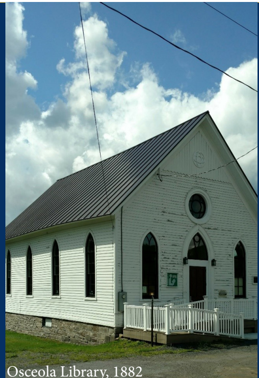
Osceola Library, 1882

The Tug Hill Commission's Technical Papers and Issue Papers are written to help local officials and citizens in the Tug Hill region and other rural parts of New York State. Technical papers provide guidance on procedures based on questions frequently received by the commission. Issue papers provide background on key issues facing the region without taking advocacy positions. Other papers are available from the Tug Hill Commission. Please call us or visit our website for more information.