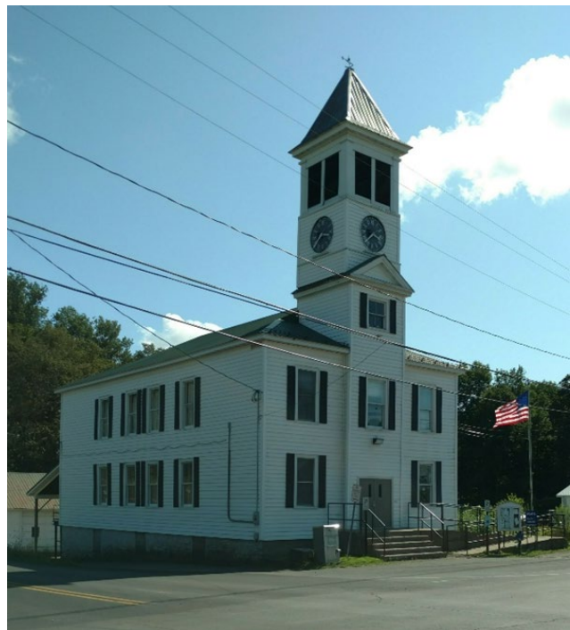
Orwell Town Hall, 1906-1909