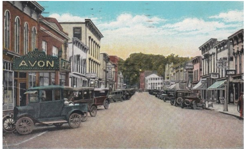
Postcard of Boonville Historic District

Importantly, those jobs have paychecks, and because the jobs are usually local, the workers who get those paychecks spend the vast majority of their income locally as well.”